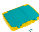
Double bottom lid for 120 L bag holder