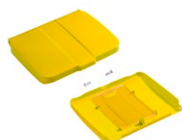
Lid 120 L bag holder with check-list holder