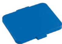
Lid for 120 L bag holder