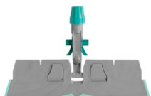
Trilogy Frame made with antibacterial polypropylene